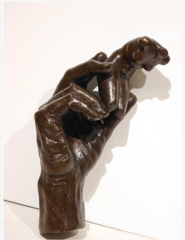
Bronze cast sculpture of a hand holding a female torso signed by Auguste Rodin (Fr., 1840-1917).