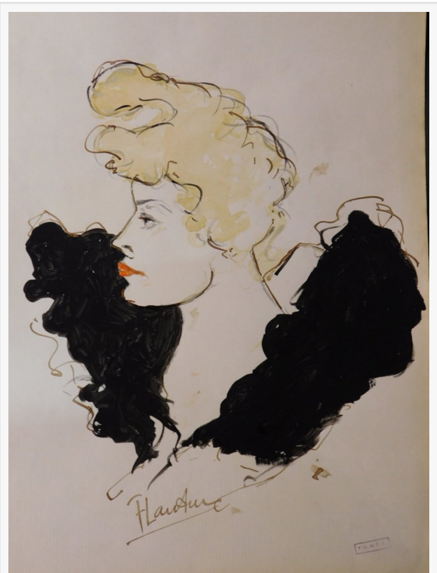
Portrait of an entertainer attributed to the renowned French artist Henri de Toulouse-Lautrec (1864-1901).