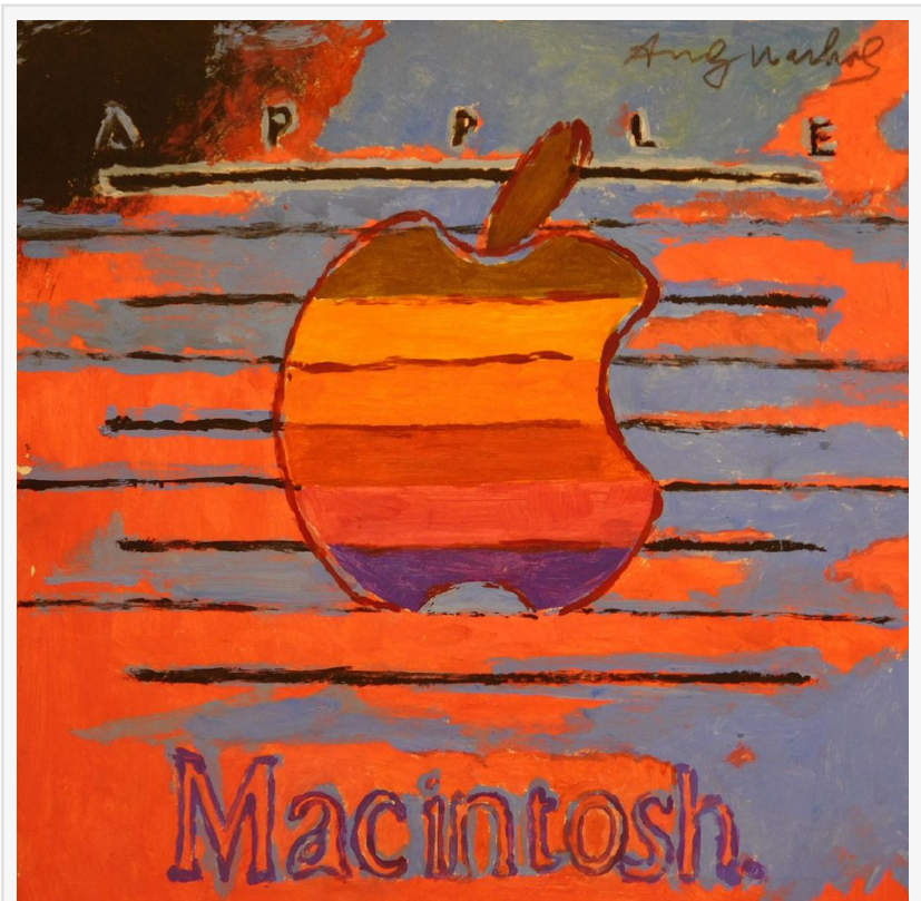
Mid-1980s gouache on paper rendering of the Apple McIntosh logo attributed to pop art legend Andy Warhol.

The Private Art Collections & Estates Discoveries Auction contains 142 lots of modestly priced artworks from consignors in Europe, England, Canada, South America and the U.S., featuring original paintings and drawings by and attributed to prominent names in 19th and 20th century art. Styles span Realism, Impressionism, Surrealism, Expressionism, Neo Expressionism and Pop.