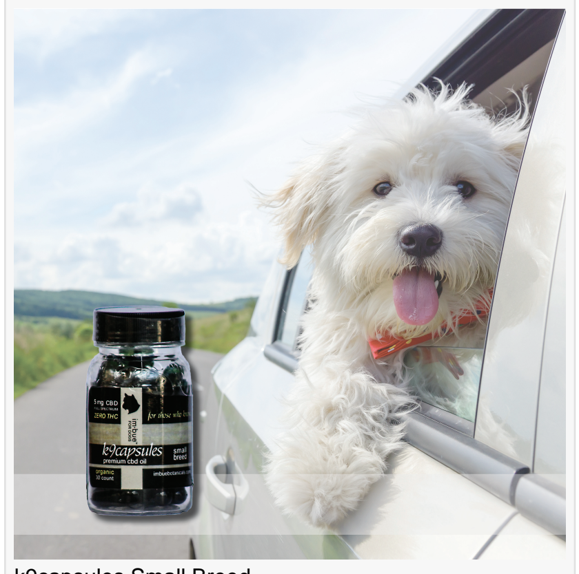
k9capsules Small Breed