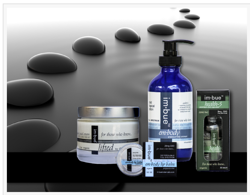
Some of Imbue Products

"We are excited about introducing Imbue Botanicals to our online customers, as well as a higher level of involvement in this fast-growing market segment" said Svet Millic R.Ph., Co-owner of Trifecta Pharmaceuticals. "We are confident that the addition of this product line for our online customers will not only help drive revenue, but most important, will provide a whole host of alternative health solutions as well. We definitely wanted a product line that was US grown and manufactured, with a design and branding that lends itself to online sales. But we also wanted to provide a product line that provided our customers the finest hemp CBD products on the