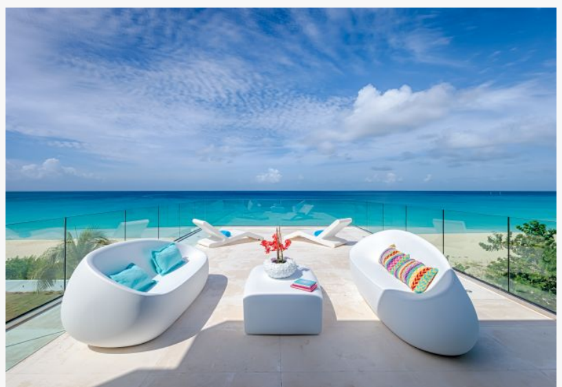
Luxury Villa Anguilla The Beach House

Niamh McCarthy Exceptional Villas +353646641170 email us here