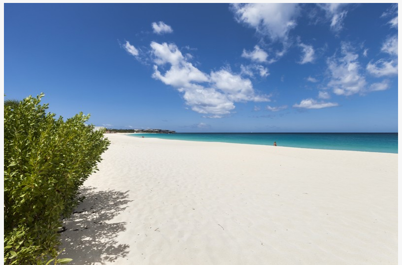
Anguilla Beach Meads Bay

In fact, once the beaches were cleaned up and electricity was restored more than three months ago, the island and Exceptional Villas have been welcoming guests to stay at their luxurious villas on the island.