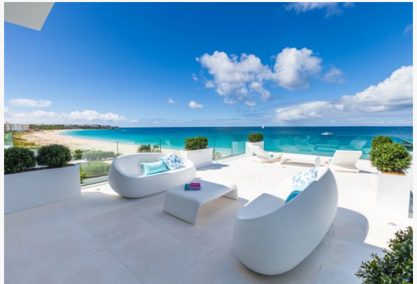
Villas In Anguilla