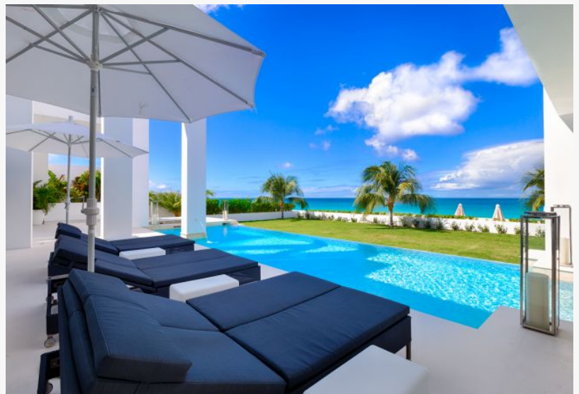
The Beach House