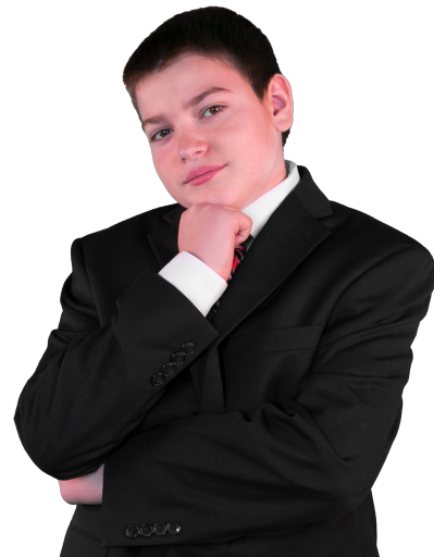
Austin Really Twin VeeR VR

This press release can be viewed online at: http://www.einpresswire.com