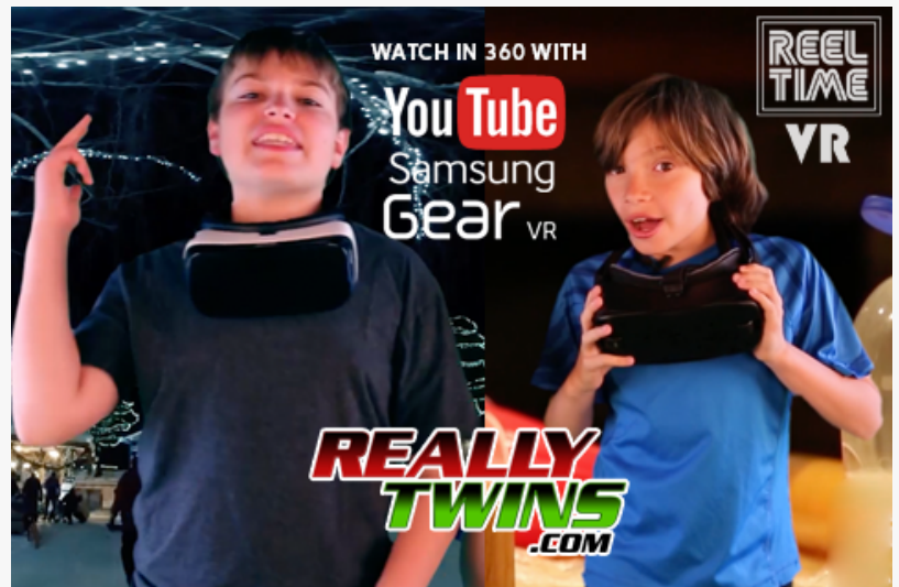
Really Twins ReelTime VR