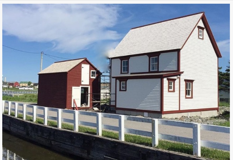
Newest restored CapeRace property located in Bonavista, Newfoundland

The Town of Bonavista has been undergoing a unique rural renewal, one that could potentially be a road map for other Newfoundland rural communities. Some say it is poised to challenge Gros Morne Park as Newfoundland's crown jewel of tourist destinations. CapeRace Cultural Adventures Inc is a boutique travel company specializing in upbeat, authentic travel experiences at Canada's most eastern island of Newfoundland. CapeRace is the only travel company that initiates real connections with the local community in a self-guided travel format.