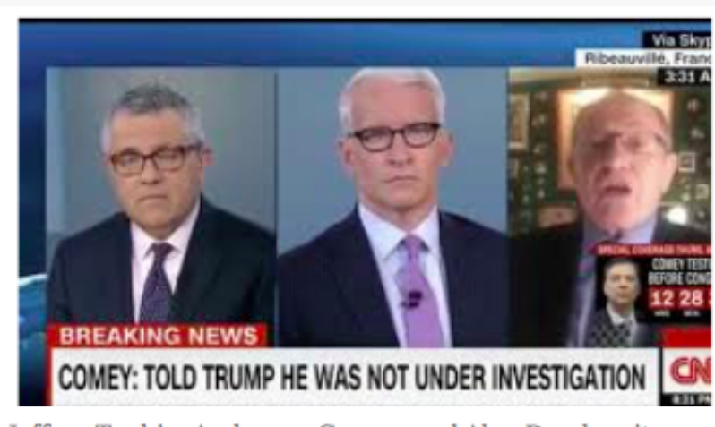
Jeffrey Toobin, Anderson Cooper and Alan Dershowitz

The vitriol coming out of the Media and their Political ally, the Democratic Party, is tantamount to "inciting the populace to riot" in an attempt to overthrow a duly elected Government by an act of