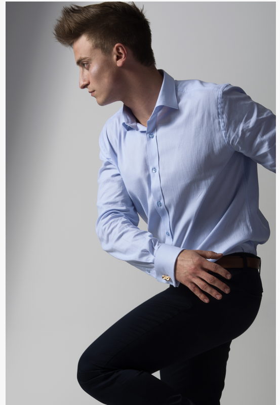
Movement, comfort and style are balanced in harmony with Hasso shirts