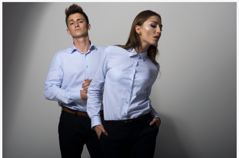
Elegant styling with Hasso Fashion's shirts for men and women

BIRMINGHAM, WEST MIDDLELANDS, UNITED KINGDOM, January 29, 2018 /EINPresswire.com/ -- Hasso Fashion will be attending their first tradeshow in 2018, with a premium pitch at the prestigious Moda fashion exhibition. The company, which designs contemporary premium shirts and cufflinks, will exhibit new collections for the first time, introducing ranges for both men and women. Their clothing is created out of a passion for high quality fashion that allows for freedom of movement.