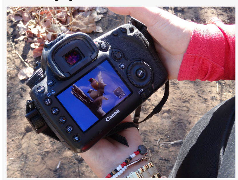
Top End Photography Tour NT Australia

This press release can be viewed online at: http://www.einpresswire.com