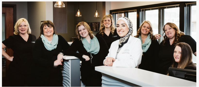
Dental Reflections Dublin Team

Dublin OH, Thursday, February 22nd 8:30am - 3pm: