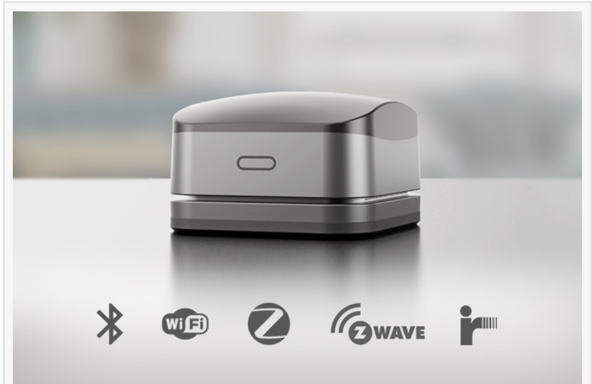
Fully loaded with multiple protocols

BEAK earns even higher praise for its support of Amazon Echo, allowing homeowners to turn off their lights or turn on romantic music (and possibly, by no coincidence, their spouse as well) with voice commands so they don't have to use the smart phone app exclusively. With its customizable, scalable platform and its AI-powered engine, BEAK will learn from your behavior and, over time, launch a synchronized ballet of interconnected lighting, music, and security devices – all of it happens after