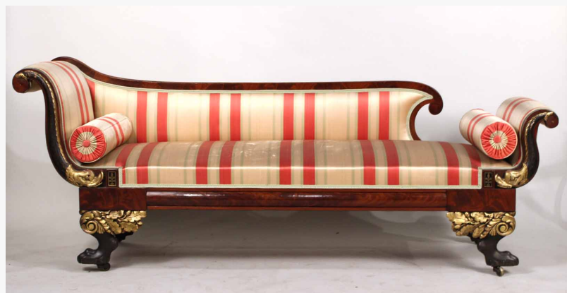
Neoclassical parcel gilt mahogany recamier, or fainting couch, made in New York City circa 1815-1825 ($25,000).

This press release can be viewed online at: http://www.einpresswire.com