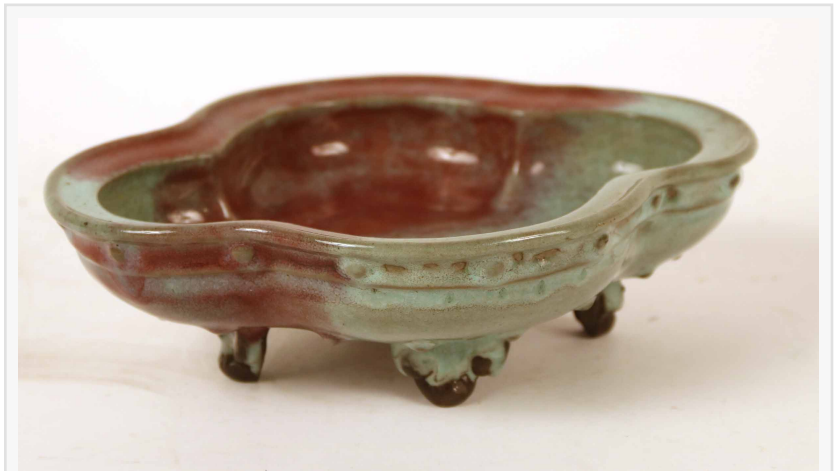
Chinese green glazed oval footed porcelain bowl, the sleeper lot of the auction ($200,000).

BLOOMFIELD, N.J., UNITED STATES, February 7, 2018 /EINPresswire.com/ -- BLOOMFIELD, N.J. – An unassuming Chinese green glazed oval footed porcelain bowl with a pre-sale estimate of just $1,000-$2,000 soared to $200,000 at Nye & Company Auctioneers' Collectors' Passion Auction held January 31st, online and in the firm's showroom at 20 Beach Street. The auction was held after Americana Week in New York City, about 15 miles away.