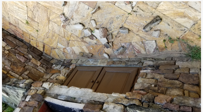
Retaliation? Scare tactics? My backyard in Bella Collina