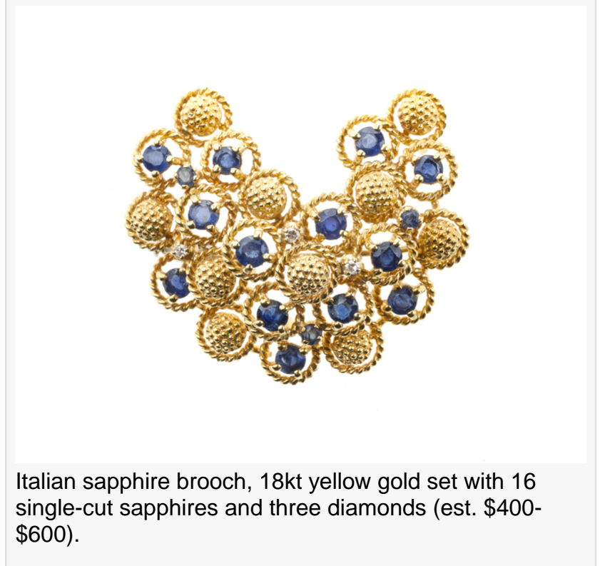
Italian sapphire brooch, 18kt yellow gold set with 16 single-cut sapphires and three diamonds (est. $400-$600).