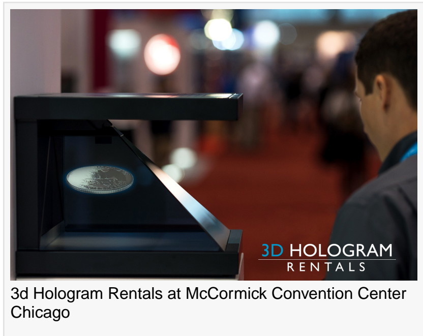
3d Hologram Rentals at McCormick Convention Center Chicago

CHICAGO, IL, UNITED STATES, February 14, 2018 /EINPresswire.com/ -- The Chicago-based hologram rental company, 3D Hologram Rentals , has released a new video showcasing its holographic installations at the 2018 AHR Expo. Taking place annually in the Windy City, the 2018 AHR Expo at McCormick Place Chicago hosted more than 2000 exhibitors. Among those exhibitors was Renewaire, a company that specializes in energy recovery ventilation products. The new video released by 3D Hologram Rentals, available to view on YouTube , captures holographic highlights from Renewaire's 3D display at the expo.