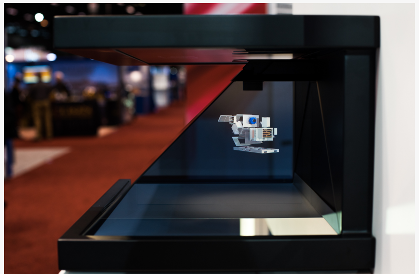
Holographic Display Side View Of Hologram