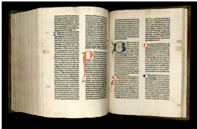
The Gutenberg Bible was created in 1450 had a profound effect on the history of the printed book. Textually, it also had an influence on future editions of the Bible. It provided the model for several later editions, including the Great Bible and King James Bible