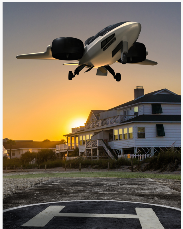
Point to Point High Speed Transport with TriFan 600

The TriFan is a major breakthrough in aviation and air travel. The six-seat TriFan 600 will have the speed, range and comfort of a luxury business aircraft and the ability to take off and land vertically,