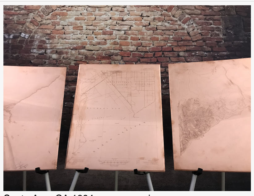
Santa Ana, CA 1894 map engravings

LOS ANGELES, CA, USA, February 20, 2018 /EINPresswire.com/ -- From civilization's inception, mankind has sought to preserve its most important records via durable engraving. In Exodus, Moses descended Mount Sinai with the Ten Commandments engraved onto stone. NASA sent the Spacecraft Voyager on its deep space mission with greetings engraved on a solid gold disc. California has its own rich history similarly preserved, recorded on immense, forgotten copper sheets archived in government warehouses.