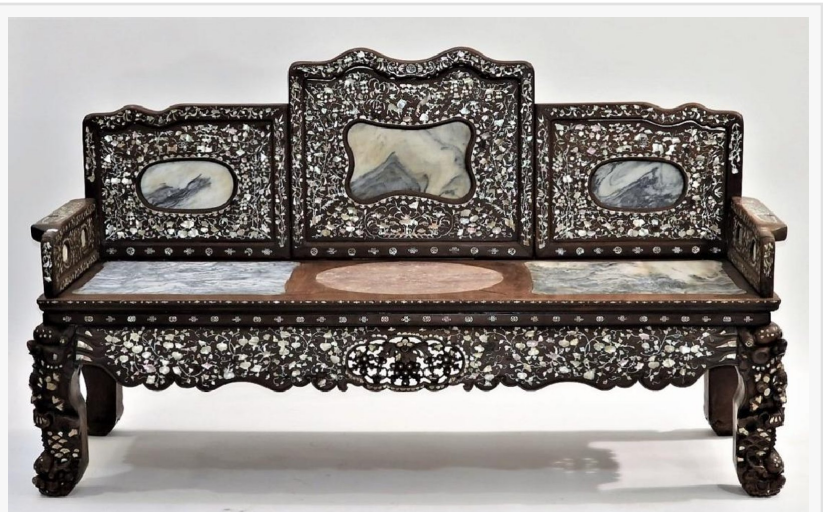
Chinese rosewood mother of pearl inlaid and marble inset bench, on mythical beast legs.

Travis Landry Bruneau & Co. Auctioneers (401) 533-9980 email us here