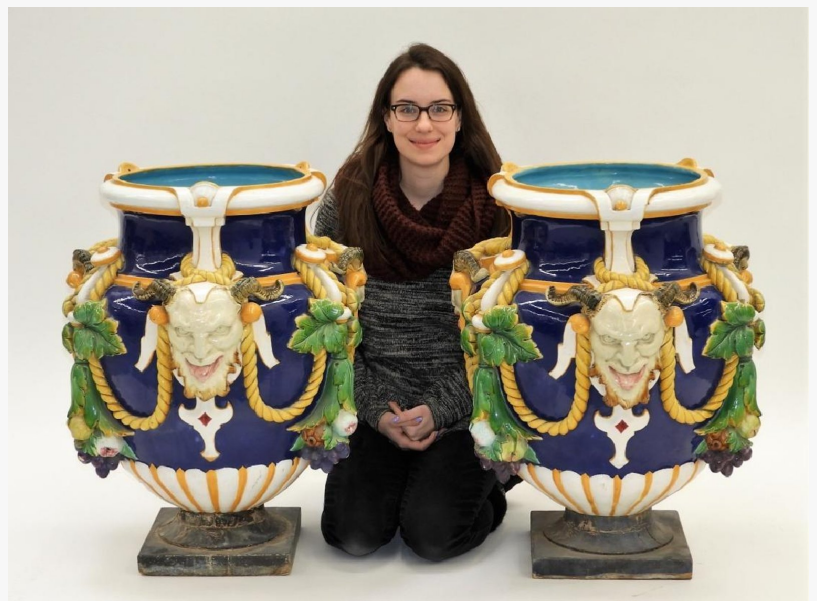
Monumental pair of circa-1865 Minton (England) majolica Bacchus vases, urn form molded.

This press release can be viewed online at: http://www.einpresswire.com