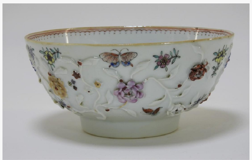
Fine Chinese Export Qianlong period porcelain floral relief famille rose bowl with applied elements.