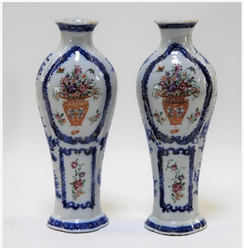
Pair of Chinese Export famille rose enameled and underglaze decorated porcelain vases, or urns, nearly 10 inches tall.