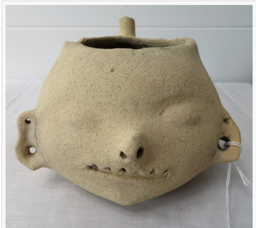
Prehistoric clay pot effigy of a human head from the Southeastern U.S., 6.5 inches tall (est. $1,000-$3,000).

The auction features American Indian art , prints and paintings, prehistoric and pre-Colombian antiquities from North, Central and South America and Europe, to include arrowheads, axes, discoidals, birdstones, pipes, celts, masks, carved figures and other stone tools, plus a collection of stone artifacts from the midwestern United States and California, and Western collectibles.