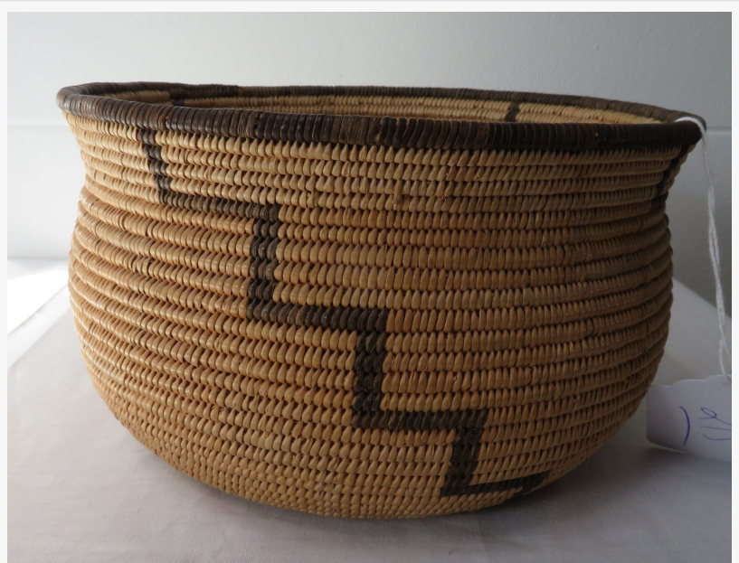
Native American handmade Chemehuevi basket, crafted circa 1920s in the Colorado River area (est. $1,000-$3,000).

A nicely carved cedarwood and paint whale figure, crafted around the 1920s in Haida (in northwestern Canada), 10 inches tall by 8 inches wide, in good condition, should command $500-$1,000. Also, a prehistoric knob-top pestle, made of basalt and found along the Columbia River, 10