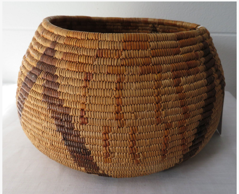
Native American handmade Mission basket from the San Diego area, circa 1920s (est. $1,000-$2,000).