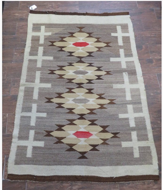
Navajo rug weaving, an early 20th century wool example, woven in New Mexico, 58" by 39" (est. $300-$600).