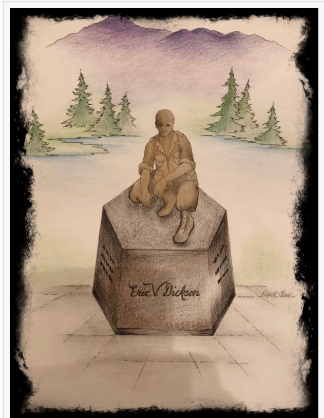
Artist Sketch of Memorial