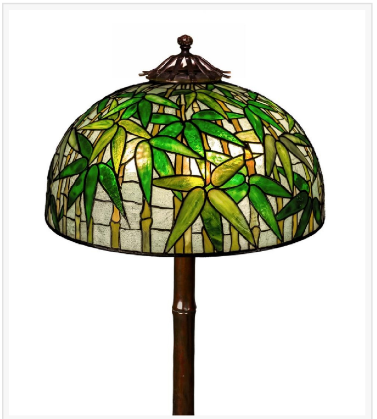
Fine and rare Tiffany Studios bamboo floor lamp, circa 1910, with 24-inch diameter shade (est. $100,000-$150,000)

The furniture category will feature a rare, special commissioned Italian Renaissance style