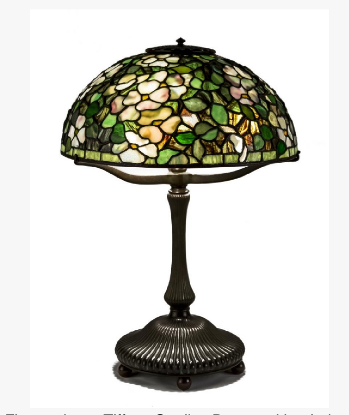
Fine and rare Tiffany Studios Dogwood leaded glass and bronze table lamp, signed Tiffany Studios (est. $40,000-$60,000).