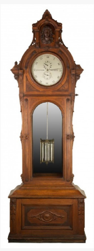
Monumental George Jones (N.Y.) astronomical regulator from 1860, 9 feet 3 inches tall (est. $30,000-$50,000).

the Willard Museum in Grafton, Mass. The case is attributed to John Doggett and houses a 22" dial. It has a time-only weight driven brass movement (est. $30,000-$50,000).