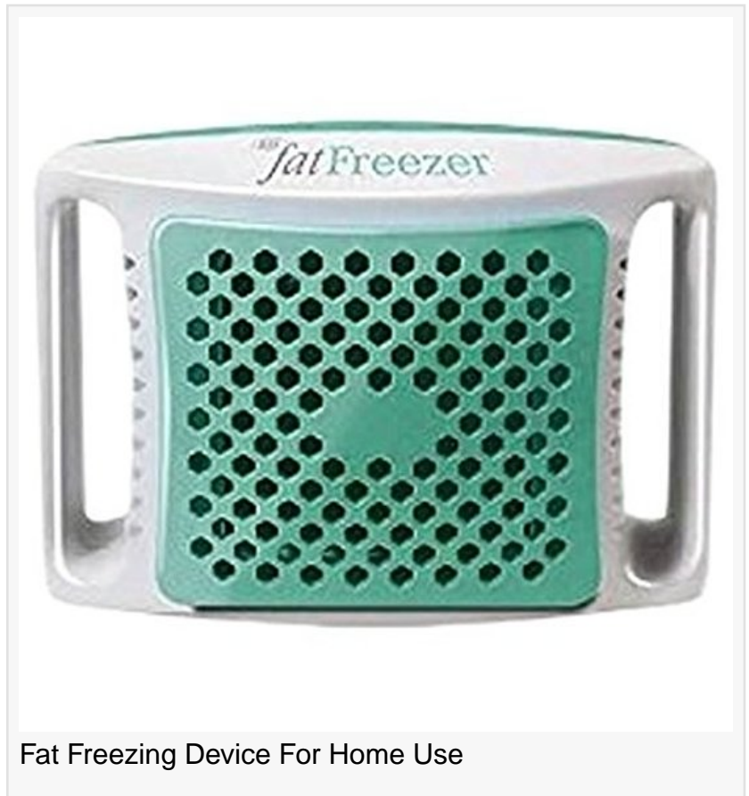
Fat Freezing Device For Home Use