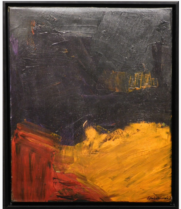
Oil on canvas abstract composition by the German-American artist Hans Hofmann (est. $60,000-$80,000).