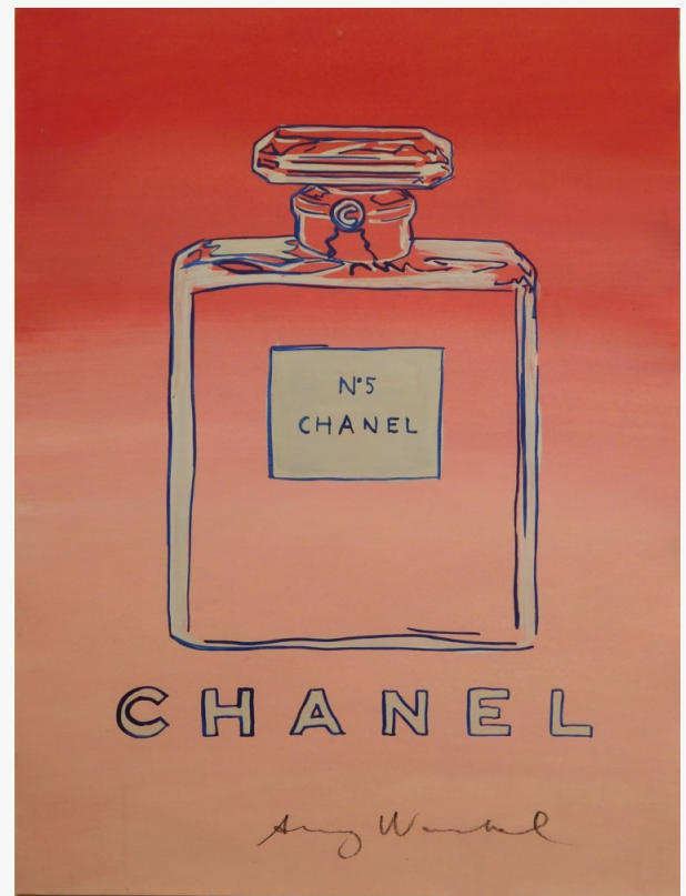
Watercolor and ink on paper attributed to Pop Art icon Andy Warhol, titled Chanel No. 5 (est. $40,000-$50,000).

An ink on paper with pencil indications attributed to Sol LeWitt (Am., 1928-2007), titled Four Color Drawing (1971), unframed and measuring one foot square, should reach $20,000-$30,000. Also,