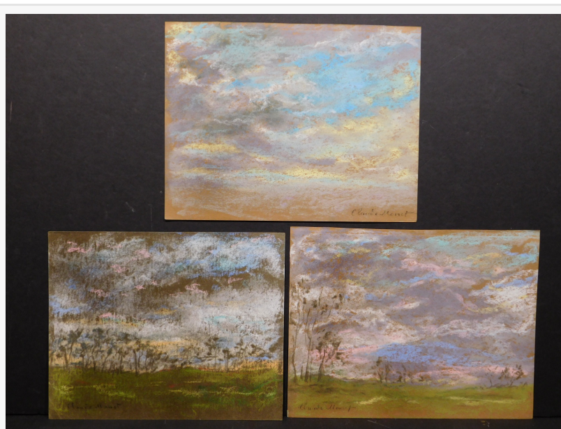
Group of three pastel on brown paper drawings by Claude Monet, being sold as one lot (est. $50,000-$80,000).

All lots can be viewed now, at www.woodshedartauctions.com . People can register and bid on the site, too (a new feature). They can also bid on lots via the popular online bidding platform www.LiveAuctioneers.com . Live bidding will commence at 5:30 pm Eastern time on Thursday, March 15th. Live previews can be arranged, by appointment, at Woodshed's Franklin gallery.