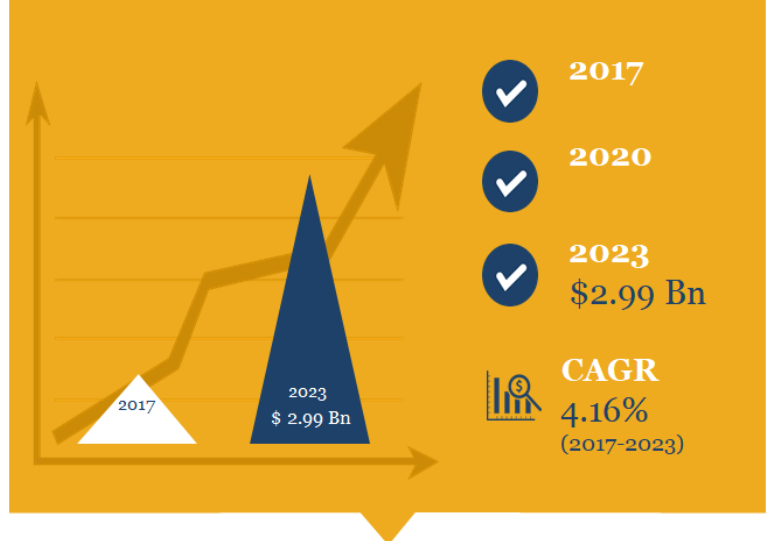
US Data Center Construction Market Size

The data center construction market in US is expected to reach values of around $3 billion by 2023 and is projected to grow at a CAGR of more than 4% during the forecast period.