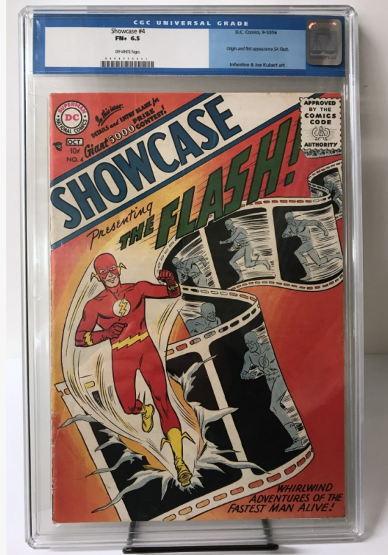
Copy of DC Comics Showcase #4 (Oct. 1956), the first appearance of Barry Allen as The Flash ($50,850).

The next day – Thursday, March 22nd, also in Lynbrook at 10 am – Weiss Auctions will conduct a sale loaded with over 500 lots of toys in all