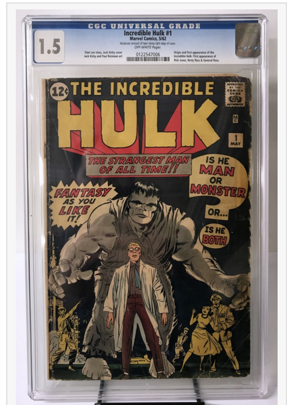
Copy of Marvel's Incredible Hulk #1, cover art by Jack Kirby, graded CGC 1.5 ($6,900).