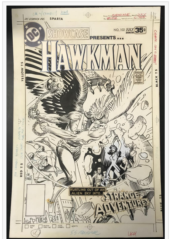
Original cover art for DC Comics Showcase #102 (July 1978), featuring Hawkman, signed by Joe Kubert ($14,250).

This press release can be viewed online at: http://www.einpresswire.com