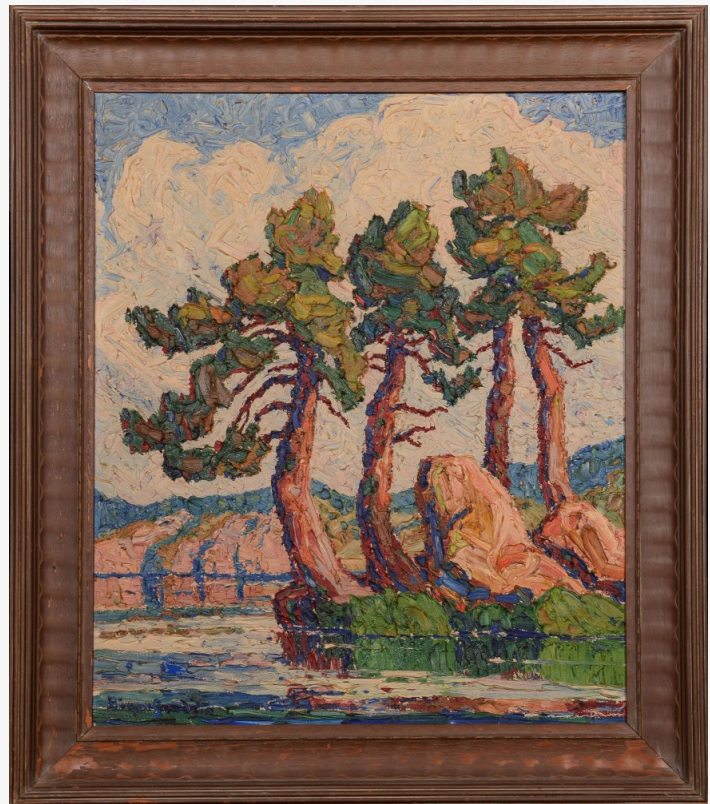
This original oil painting by Sandzen titled Lake in the Rockies finished at $75,000.