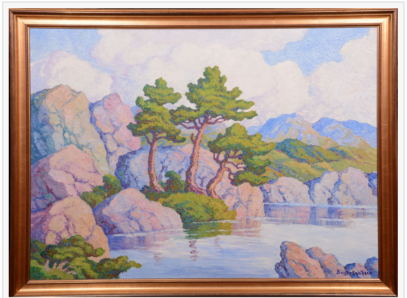
This painting by Sandzen was officially untitled but might be Glimpse of Mountain Lake. It sold for $90,000.

Following are additional highlights from the auction. All prices quoted are hammer. All lots sold to the highest bidder, with no reserves or minimums.