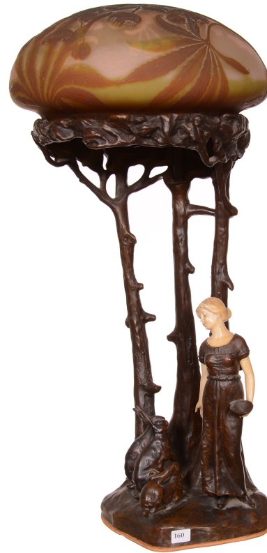
Galle signed figural table lamp with a French cameo art glass shade ($17,000).

Vases by Tiffany and Daum Nancy consistently brought high prices. A French cameo art glass vase signed Daum Nancy, 15 ¼ inches tall, having a mottled yellow and amethyst background with a cameo