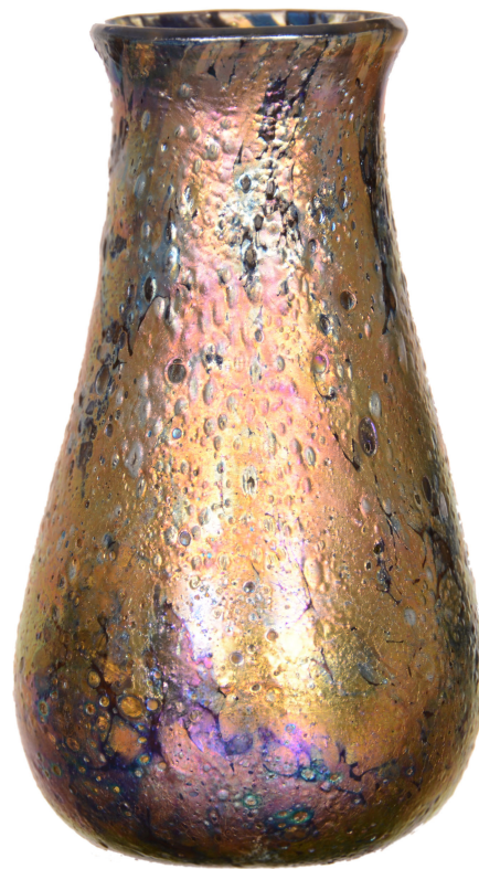
Rare Tiffany Cypriot art glass vase boasting gorgeous colors, 5.5 inches tall ($6,000).