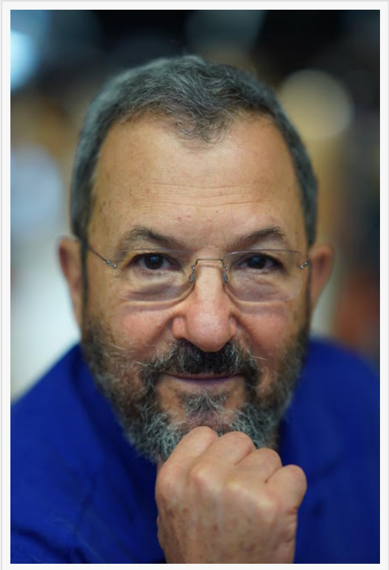
Former Israeli Prime Minister Ehud Barak talks about his new memoir on May 17. Presale begins March 20 through Citi.

This press release can be viewed online at: http://www.einpresswire.com