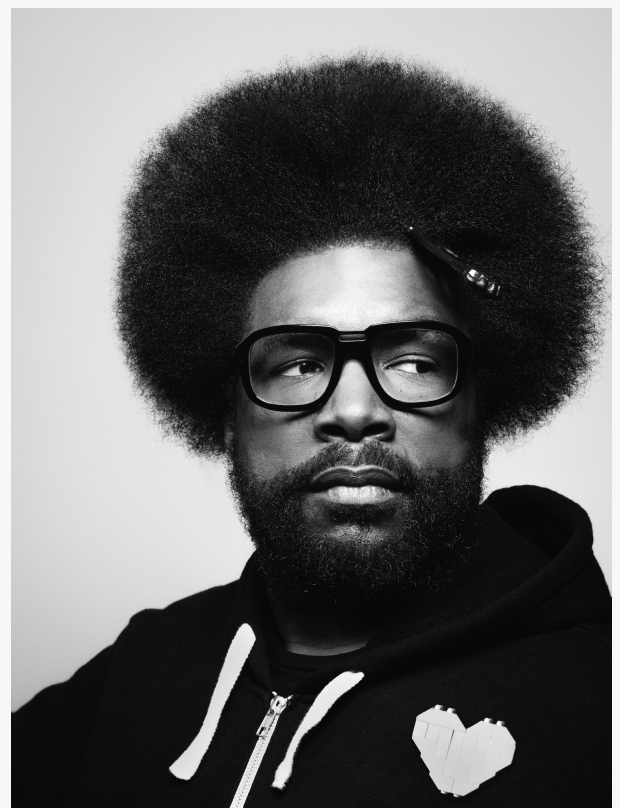
Musician and author Questlove talks about his new book "Creative Quest" in Los Angeles.

Drummer, DJ, producer, culinary entrepreneur, New York Times best-selling author, and member of The Roots — Questlove is the unmistakable heartbeat of Philadelphia's most influential hip-hop group. He is the Musical Director for "The Tonight Show Starring Jimmy Fallon," where his beloved Roots crew serves as house band. Beyond that, this 4-time GRAMMY Award winning musician's indisputable reputation has landed him musical directing positions with everyone from D'Angelo to Eminem to Jay-Z. Questlove has also released three books including the New York Times bestseller "Mo' Meta Blues," "Soul Train: The Music, Dance and Style of a Generation" and most recently the James Beard-nominated "somethingtofoodabout," and his new book "Creative Quest" will be released in April of 2018. One of his latest endeavors has been becoming a strategic advisor, and the first artist ambassador for Pandora, as well as hosting a new series "Questlove Supreme." He also co-produced the GRAMMY Award winning Original Broadway Cast Recording of "Hamilton." Most recently, Questlove and The Roots announced that they are developing an animated children's series, along with a live action children series, in partnership with Amazon. Questlove is a Celebrity Ambassador for Food Bank For New York City, is on City Harvest's Food Council, a board member of Edible Schoolyard, and the first Artist-in-Residence at the Made in NY Media Center. Questlove is also a