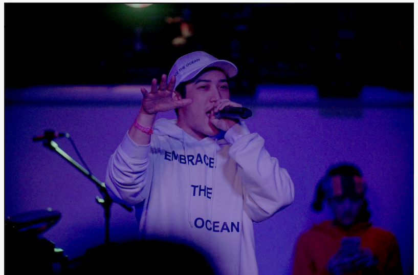
2018SXSW Taiwan Beats shoecase PoeTeK