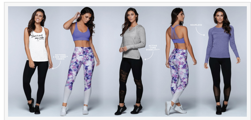
Lorna Jane Canada Marathon Essentials

Footwear is crucial for a run, especially one that spans 42.2 kilometers. You'll want to ensure that your shoes are relatively lightweight while still providing good support. If they are new, take the time to break them in first at your marathon pace. This test run will determine whether you're likely to