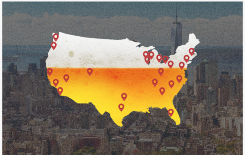
Tour 25 US Cities or 85 Around The Globe

NEW YORK, USA, March 15, 2018 /EINPresswire.com/ -- From March 23rd through March 25th, 2018, Beer Adventures is giving U.S. based beer and food fans the chance to take a free beer tour in 25 different U.S. cities or 85 others across the globe . Next Friday, Saturday and Sunday, which fall on the same weekend as 2018's Sweet Sixteen round of March Madness, are now officially a part of a 3-day holiday being dubbed National Free Beer Tour Weekend .