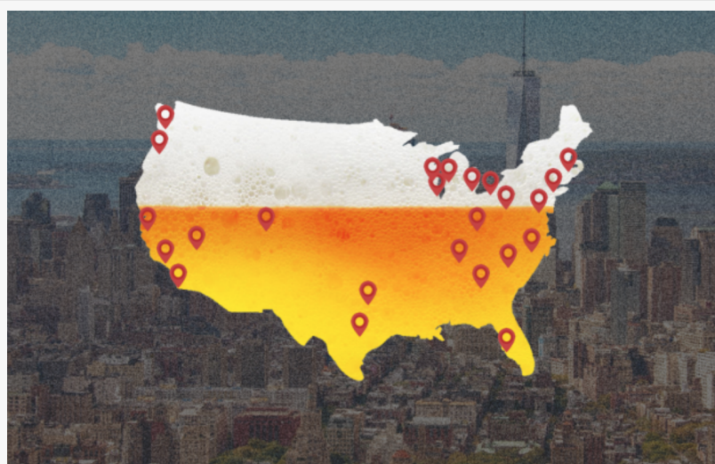
Tour 25 US Cities or 85 Around The Globe

NEW YORK, USA, March 15, 2018 /EINPresswire.com/ -- From March 23rd through March 25th, 2018, Beer Adventures is giving U.S. based beer and food fans the chance to take a free beer tour in 25 different U.S. cities or 85 others across the globe . Next Friday, Saturday and Sunday, which fall on the same weekend as 2018's Sweet Sixteen round of March Madness, are now officially a part of a 3-day holiday being dubbed National Free Beer Tour Weekend .