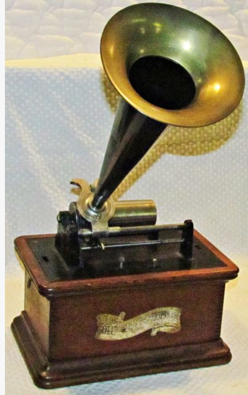
Edison Columbia graphophone from around 1900 with four cylinder records, in a figural oak case in excellent condition.

The Atwater Kent model 20C receiver set and speaker is a big box radio from the mid-1920s, in "as-found" condition and housed in a cabinet in very good condition, with no cracks, chips or mars. The Columbia gramophone dates to around 1900 and comes with four cylinder records. The figured oak case is in excellent condition and the reproducer and original crank are working.