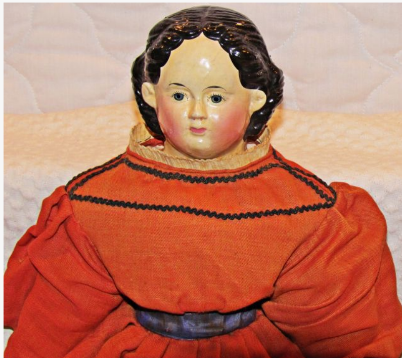
Ludwig Greiner shoulder-head doll with hand-made clothing, in excellent condition with no paint loss.