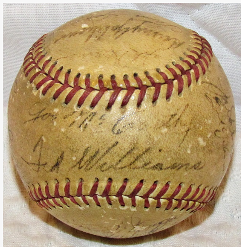
Late 1940s baseball signed on the sweet spot by Ted Williams, plus Joe McCarthy, other Red Sox players.

The baseball signed by Roberto Clemente is also signed by many other Pittsburgh Pirate team