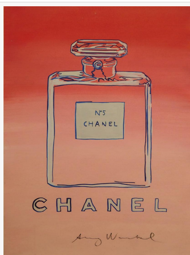
Watercolor, gouache and ink on paper of the perfume Chanel No. 5 attributed to Andy Warhol ($32,400).

The rendering of the Absolut Vodka bottle, also a signed and framed gouache on paper, may have also been a study, for Warhol's commission in 1985 for what became one of the most successful ad campaigns of the 20th century. It made $12,000. The Elvis image – a mixed media drawing on white paper, unframed – was felt pen-signed on the image and in pencil verso. It realized $6,000.