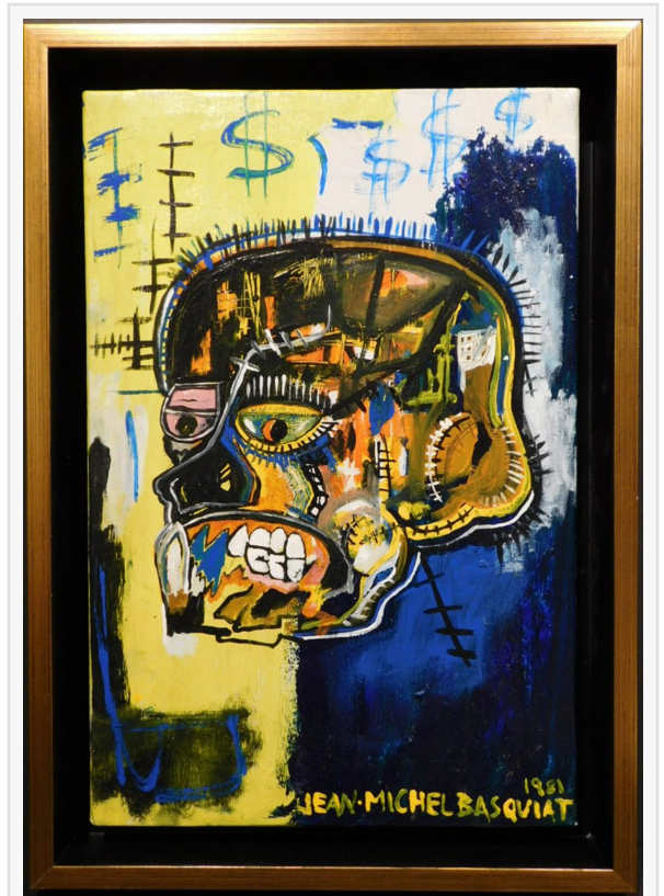
Oil on canvas painting attributed to the late Pop Artist Jean-Michel Basquiat, titled Portrait of a Man ($12,000).

This press release can be viewed online at: http://www.einpresswire.com