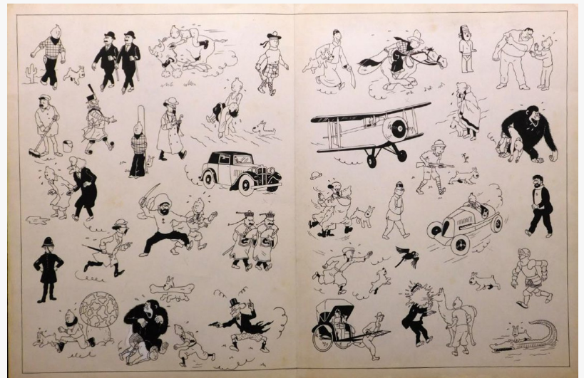
Illustrations of Tintin by Georges Remi Herge, original ink drawings with pencil indications ($21,875).