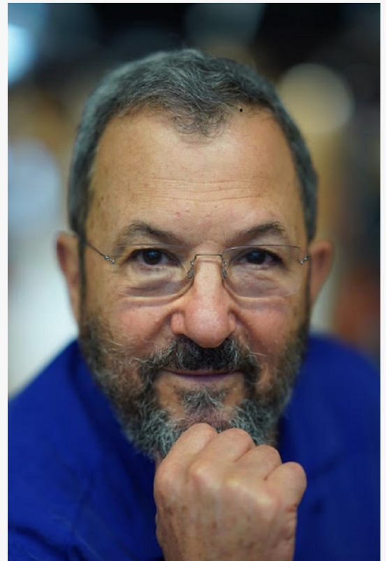
Former Israeli Prime Minister Ehud Barak talks about his new memoir at two separate Los Angeles events.

"My Country, My Life" tells the unvarnished story of his—and his country's—first seven decades; of its major successes, but also its setbacks and misjudgments. He offers candid assessments of his fellow