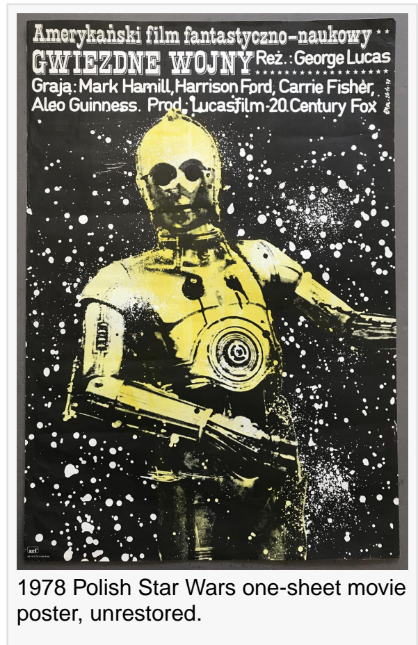
1978 Polish Star Wars one-sheet movie poster, unrestored.