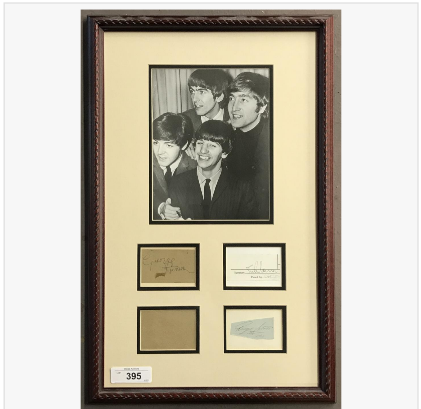
Framed group of individual signatures of all four Beatles, displayed beneath a photo of the Fab Four.

The poster category continues with a 1978 Polish Star Wars one-sheet movie poster, unrestored; a 1932 Europe and Brazil Graf zeppelin travel poster, HAPAG, by Paul Theodore Etbauer; and a Veedol