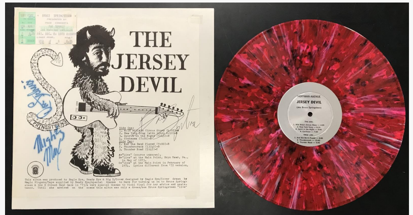
Bootleg Bruce Springsteen LP titled Jersey Devil, signed by Springsteen, Weinberg and Federici.