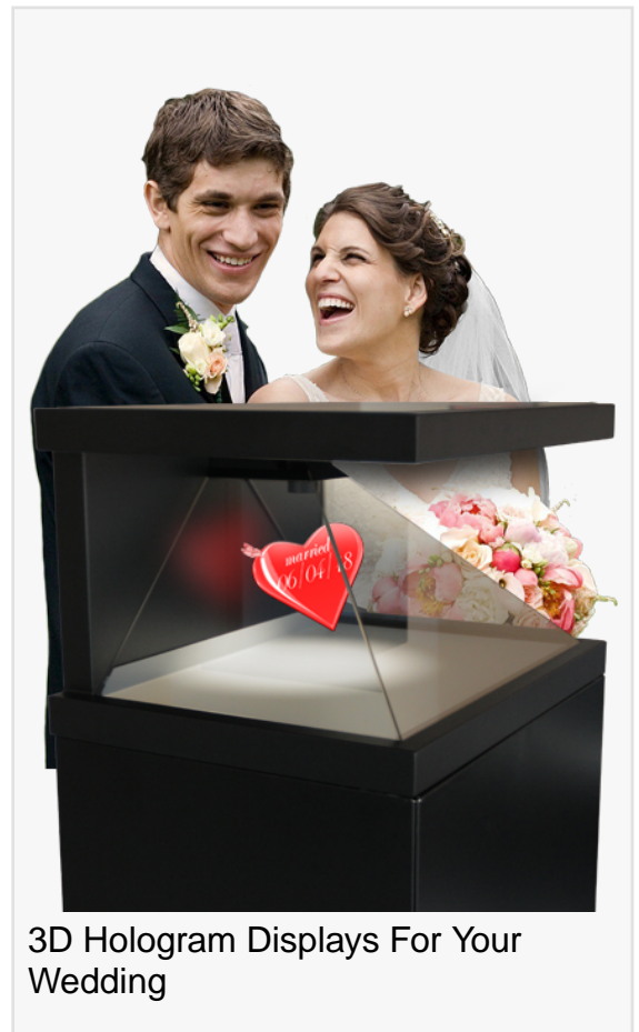
3D Hologram Displays For Your Wedding

“The cost of the rental is very reasonable,” Smith continued, noting how surprised many clients were