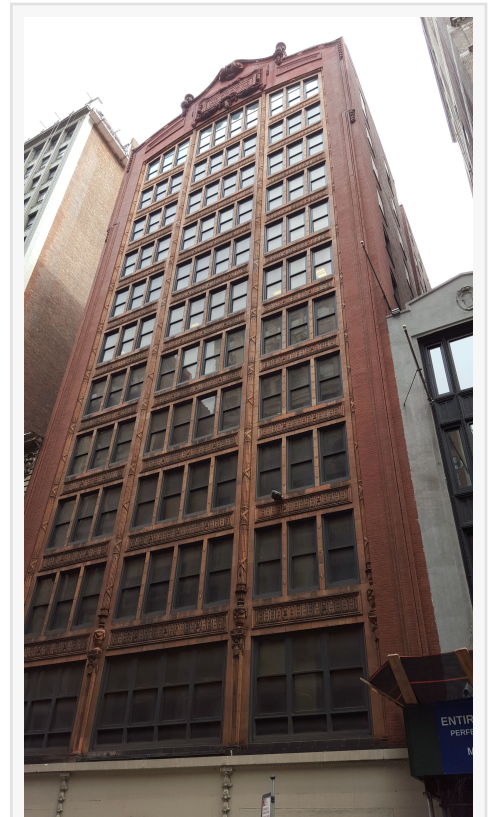
Jay Suites Newest Location 15 West 38th Street

Kimberly Macleod kmacconnect pr 917-587-0069 email us here