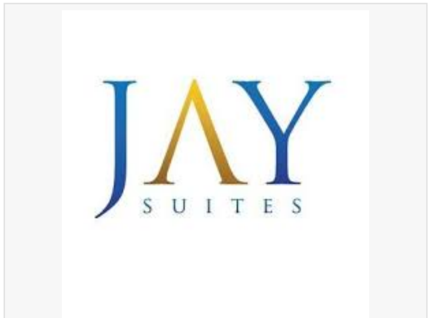
Jay Suites Logo

NEW YORK, NY, UNITED STATES, March 30, 2018 /EINPresswire.com/ -- Jay Suites announced today that it has signed a 17-year, triple net lease for the entire 12-floor building at 15 West 38th Street that served as headquarters for Hudson's Bay Company, owner of Lord & Taylor, Saks Fifth Avenue and Gilt Groupe. The 90,000-square-foot building expands Jay Suites portfolio to 8 properties and more than 5,000 workstations and will include a signature 22,000 square foot Jay Conference center on the retail 2nd and 3rd floors, Jay Café on the ground level, a rooftop terrace, as well as Jay Suites offices and workspaces on 7 floors. Jay Suites was founded in 2009 with a vision to offer affordable, spacious, sophisticated work environment for maximum productivity. The location is expected to open in Summer of 2018.