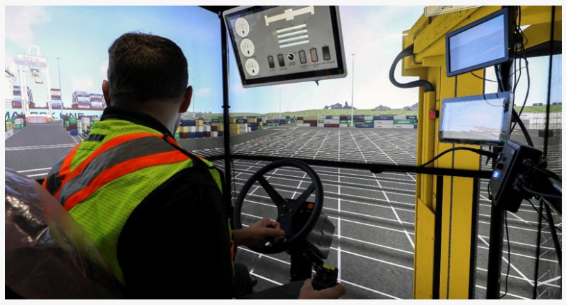
Straddle Carrier Training in the 5th Generation Full Mission System

realism crane operators experience when training on GlobalSim's 5th generation Full Mission System. Crane models, feeder ships, cargo loads, and all other pieces inside a port scenario have been enhanced to improve the simulated training experience.