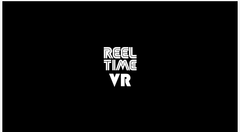
ReelTime VR Logo

This press release can be viewed online at: http://www.einpresswire.com