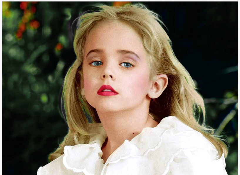
JonBenet Ramsay

Although Ed Edwards was convicted of only 5 murders the discoveries presented in the book have led many to believe that the spree could have exceeded 60 people spanning over 60 years including many of the most famous murders of all time. Murders such as those committed by the Zodiac Killer,