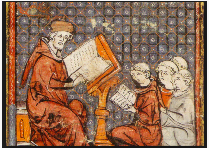
Bible Reader reading to people in Church in 1550 England. The King of England ordered a reader in each Church because most common people were illiterate

TAMPA, FLORIDA, UNITED STATES, March 30, 2018 /EINPresswire.com/ -- According to the American Bible Society news a recent study by Pew Research Center, the American public is becoming less religious and less likely to attend church than in decades past. However, the study also found Christians are increasingly turning to Bible App's to access the Bible. The ease of having a Bible, on their person, was made possible via recent smartphone Technology. Millions now carry the Bible with them on their mobile phone. It's with that reality that American Bible Society News wanted to take a look at how this new Technology is changing Christians Bible Study habits.