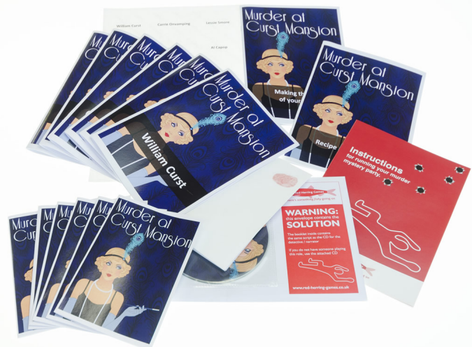
Murder at Curst Mansion Box Contents