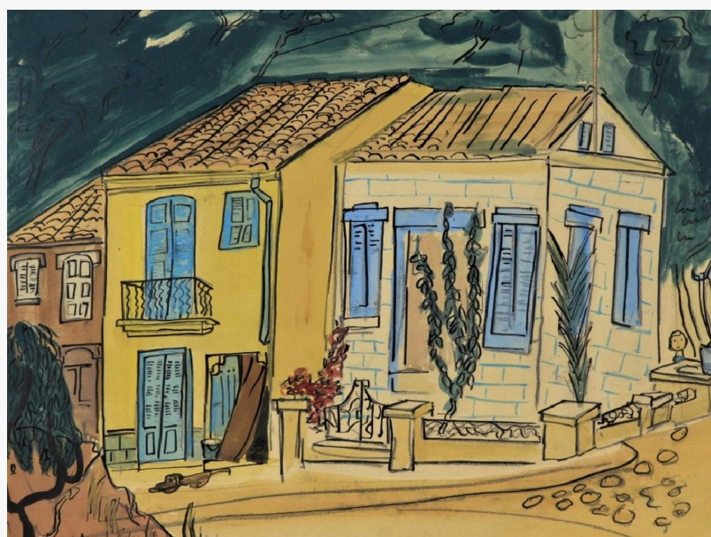
Casein paint, ink and pencil on board by Ludwig Belemans, signed and dated 1956 (est. $6,000-$9,000).

Co. to arrange for a preview appointment, at 401-533-9980. The entry is comprised of upright columns, two overhead lentils and a footer stone, with carvings of deities throughout. The archway is massive and has an estimate of $2,000-$3,000.