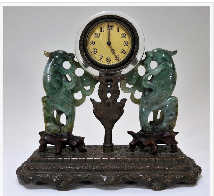
Late 19th century jade rock crystal bronze shelf clock, made in China and Switzerland (est. $2,500-$4,000).

The oil on canvas painting by LaMont Adelbert Warner (Am., 1876-1970), is a fine example of the artist's impressionist hand, capturing a warm fall day (est. 1,000-$1,500). The canvas is 22 inches by 26 ½ inches and the work is signed and dated 1934. Also, a 19th century oil on canvas laid on Masonite Chinese Canton Trade painting of a woman seated in a robe, with a table and flower pot by her side, measuring 28 inches by 23 inches framed, should finish at $1,000-$1,500.