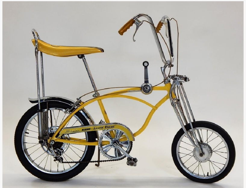
Several 1960s-era kids' bikes will be sold, to include this 1969 Schwinn Stingray Lemon Peeler, Krate series (est. $1,000-$1,500).