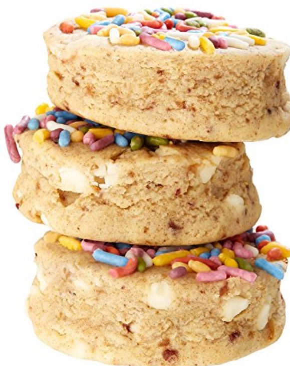
New Rule Breaker Snacks Birthday Cake Sweet Treats available on Amazon

This press release can be viewed online at: http://www.einpresswire.com