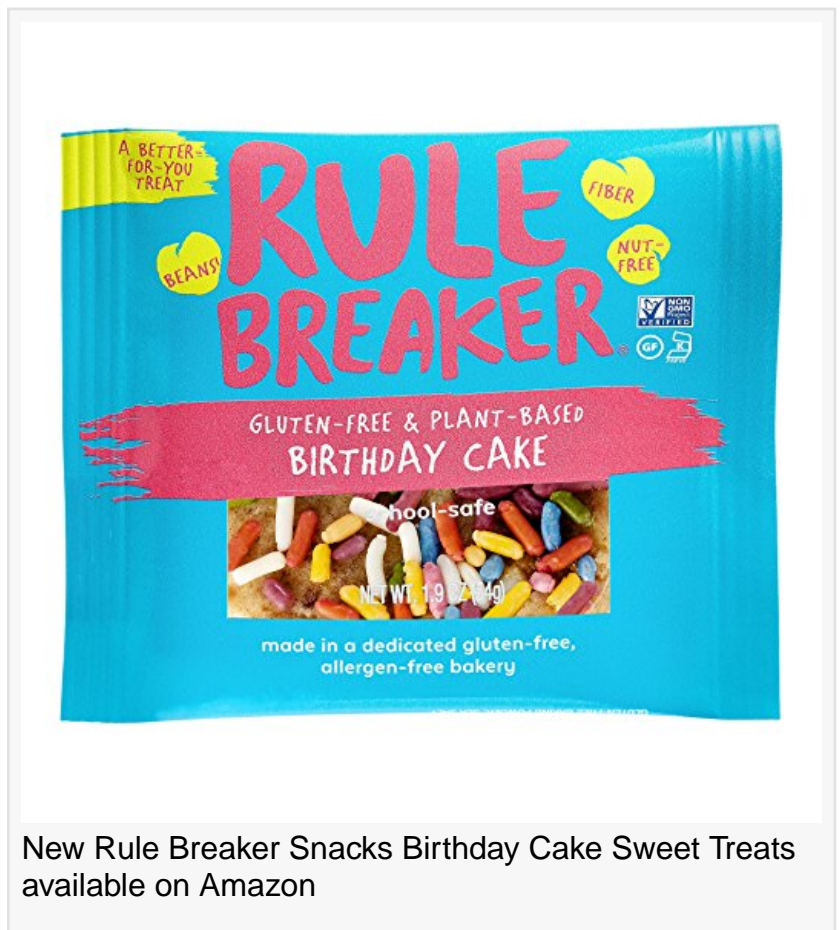
New Rule Breaker Snacks Birthday Cake Sweet Treats available on Amazon

Rule Breaker Snacks are available on Amazon as well as in select retailers. For more information about Rule Breaker Snacks, please visit rulebreakersnacks.com . To stay up to date on other news and information from Rule Breaker Snacks like the company's Facebook page, and follow Rule Breaker Snacks on Twitter and Instagram.