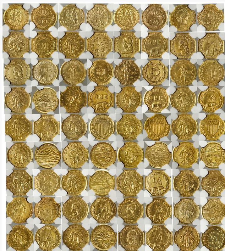
Outstanding 36-coin "Harts Coins of the West" set of gold coins, or tokens ($41,572).