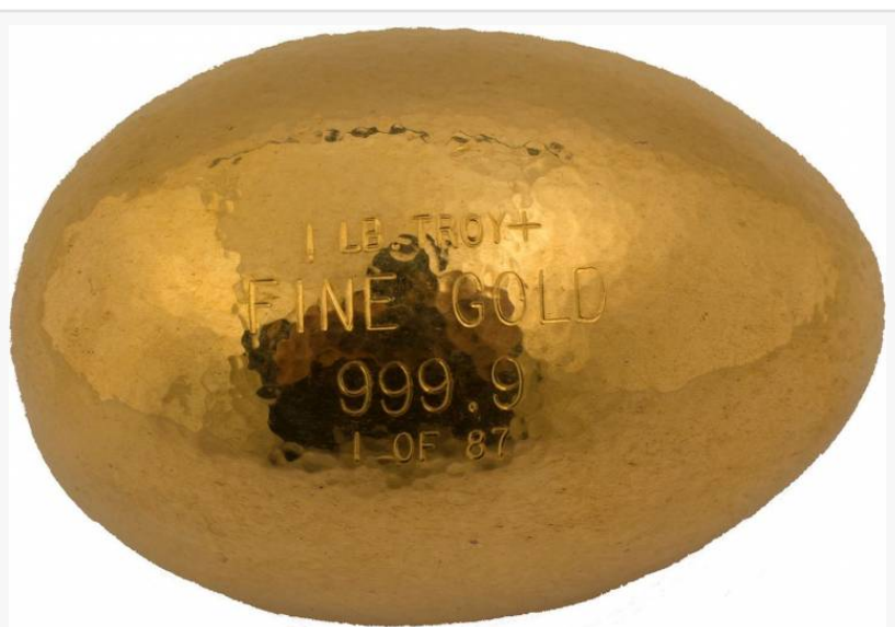
Spectacular solid gold goose egg, hand-hammered and crafted by a Phoenix jeweler in 1982 ($24,100).

An attic-found Henry model 1860 repeating rifle, nicknamed the “Damn Yankee Rifle” for its effectiveness, made by New Haven Arms Co. (Conn.), the late frame brass model, patented Oct. 16, 1860, hit the mark for $18,750. Also, a 19th century Will and Fink Company (San Francisco) barber's chair, refinished and reupholstered with velvet purple upholstery, gaveled for $5,625.