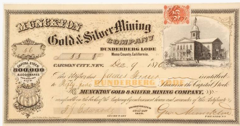
Munckton Gold & Silver Mining Company (Calif.) stock certificate, dated Dec. 9, 1870 ($1,125).