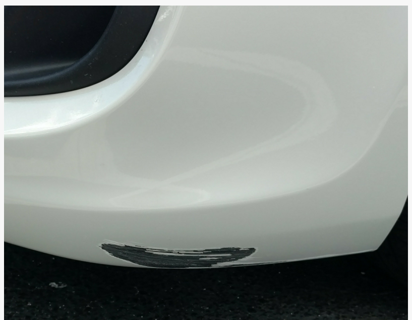
Significant scrape creates possible financial liability for renter