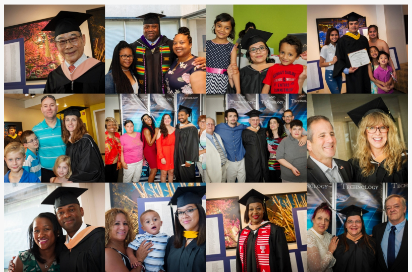
UMT graduates, families and friends

UMT also offers a Master's degree in Public Administration (MPA), for students who want to focus heavily in public sector management.