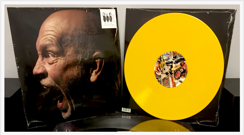
Vinyl Art for HELL on Earth [Stereo Version] Available on April 21, 2108 at record stores

Recent happenings include the new worldwide tour of additional photos from Sandro and Malkovich's photo collaboration Malkovich, Malkovich, Malkovich: Homage To Photographic Masters, and a showing of Sandro's