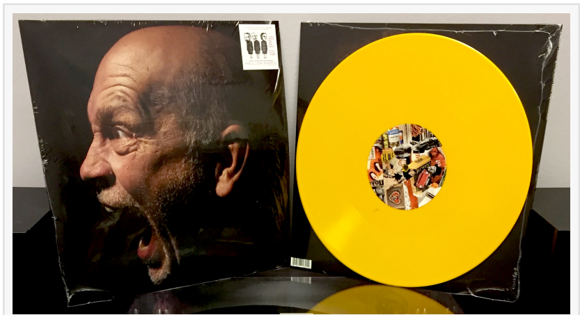
Vinyl Art for HELL on Earth [Stereo Version] Available on April 21, 2108 at record stores