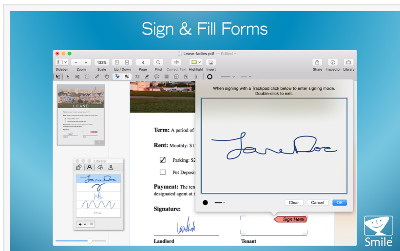
Easily fill and sign forms

PDFpen and PDFpenPro 10 work with PDFpen for iPad & iPhone version 3, allowing seamless